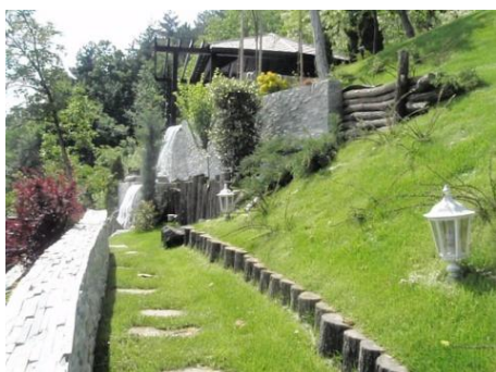
Fig. 14 – The resulting green embankment

The geomatress was filled with vegetal grinded vegetal soil, than the roller turf grass was placed and the the dendrological material planted according to the project (fig. 14 and 15)