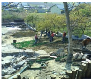
Fig. 12 – Midway stage of filling the geocells with soil