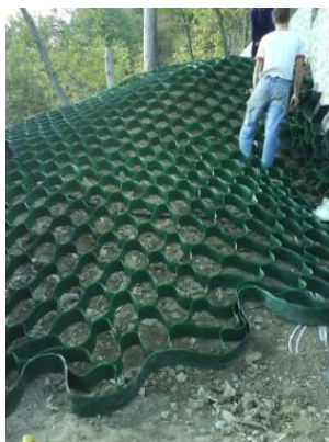
Fig. 8 – Installing the geocell network

To strengthen the embankment using reinforced soil technology construction work began with stripping the land and preparing the substrate on which to install Tenweb geocells network installed in the hole to the ground with small particle size (fig. 8; 9; 10).