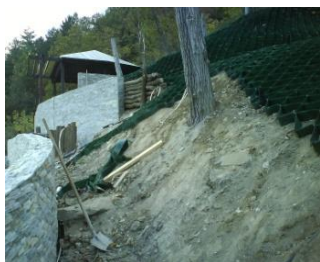
Fig. 11 – Joining the geocell strips

The geomatress strip was then fixed with clips 1,5m apart to assure a better contact between the geomatress and the support layer.