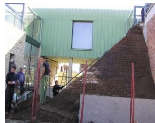
Fig. 6 – Fixing the armed embankment

4. The remaining geogrid was turned, tensioned and fixed with clips (fig. 5).