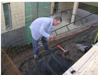
Fig. 4 – Installing armed layers with Buzau Mesh

3. The soil was spread over the geogrid, compacting in layers of approx. 30cm. In order to achieve a density of land greater than 95%. Up to a distance of approx. 0.5m from the embankment line slightly to use a roller or a vibrating plate, the remains will be compacted using a standard compactor working in the direction parallel to the slope.