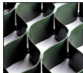
Fig. 3 – Geocell material (Tenweb)