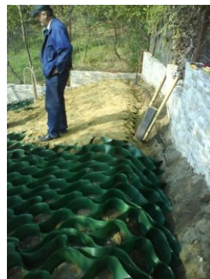
Fig. 10 – Fixing the geocell network

Over the geocell layers, the reinforced geomattress Multimat was installed which is designed to reduce by more than 50% the amount of eroded soil (compared with the ground naked devoid of vegetation)