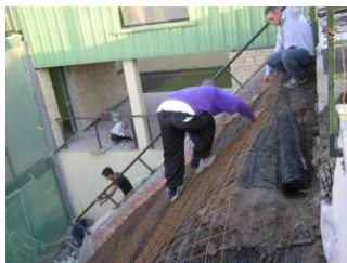
Fig. 5 – Fixing the arming