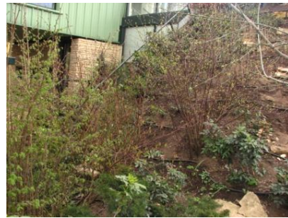
Fig. 7 – Plant material installed on embankment

To strengthen the embankment using reinforced soil technology construction work began with stripping the land and preparing the substrate on which to install Tenweb geocells network installed in the hole to the ground with small particle size (fig. 8; 9; 10).