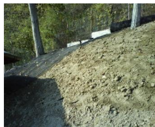
Fig. 13 – The final stage of filling the geocells with soil

The geomatress was filled with vegetal grinded vegetal soil, than the roller turf grass was placed and the the dendrological material planted according to the project (fig. 14 and 15)