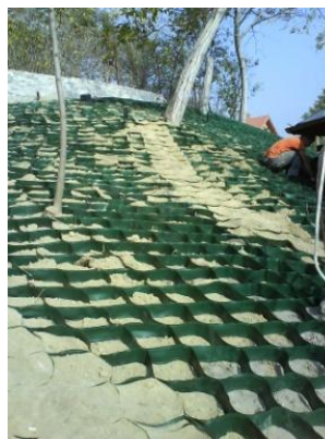
Fig. 9 – Filling the geocell with soil