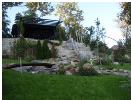
Fig. 15 – The embankment with turf grass.